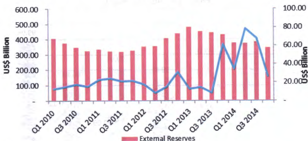
Figure 3: External Reserves and Capital Inflow (US$ Billion)