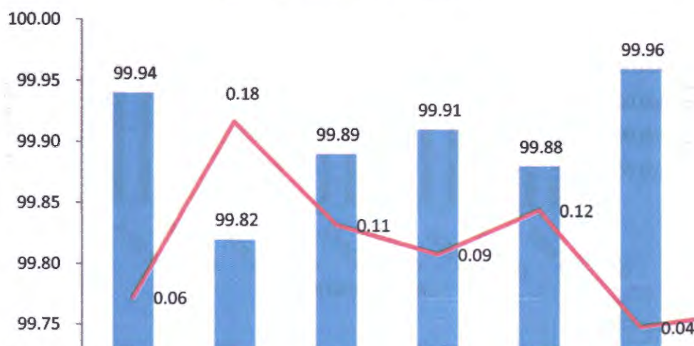
Figure 2: Resident and Non-Resident Foreign Currency Deposit (Share of Total Foreign Currency Deposits)