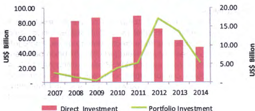
Figure 1: FDI and Portfolio Investment Flows (US$ Billion)

Analysis of other investment inflows, particularly foreign currency deposits, revealed that resident foreign currency deposit as a percentage of total foreign currency deposit remained over 99 per cent throughout the period while that of non-resident foreign currency deposit was less than 1 per cent during the same period as indicated in Figure 2.